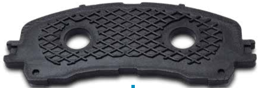
Mechanical Retention System (MRS) backing plate

Ultimate 4WD Disc Brake Pads are engineered to partner slotted rotors, are manufactured with Bendix premium Mechanical Retention System (MRS) with our newest, most high-tech ceramic formulation, and they provide a low dust and low noise user experience with Bendix's highest performance specialised 4WD brake pad system.