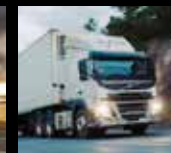
European Prime Mover