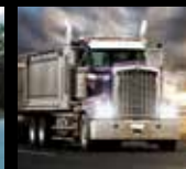
US Driveline Prime Mover